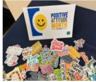
October Club Meeting included a lesson on ways to be positive for "Positive Attitude Month"