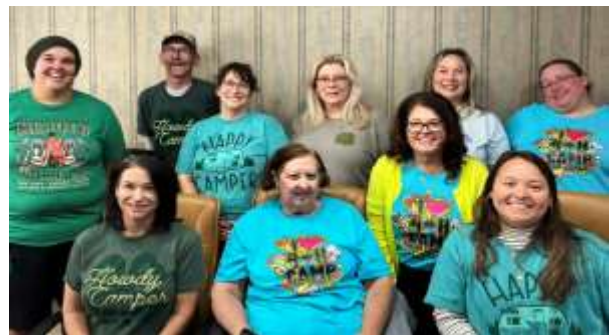
Boyd County Extension staff wore their favorite 4-H Camp T-shirts in honor of International Wear Your Summer Camp T-shirt Day #campshirtday