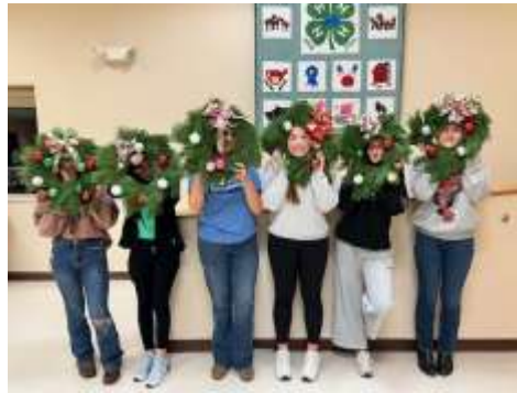
In December Teen Council members made Holiday Wreaths from live greenery and crafted homemade Christmas greeting cards which were mailed to service men and women stationed overseas