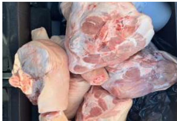
Project hams fresh from supplier