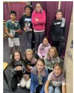
Students pose with make and take crafts.