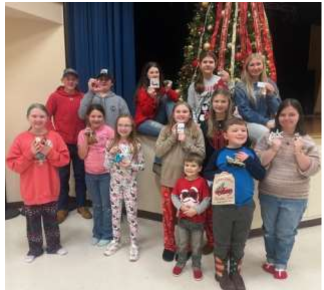
Livestock Club Christmas Party