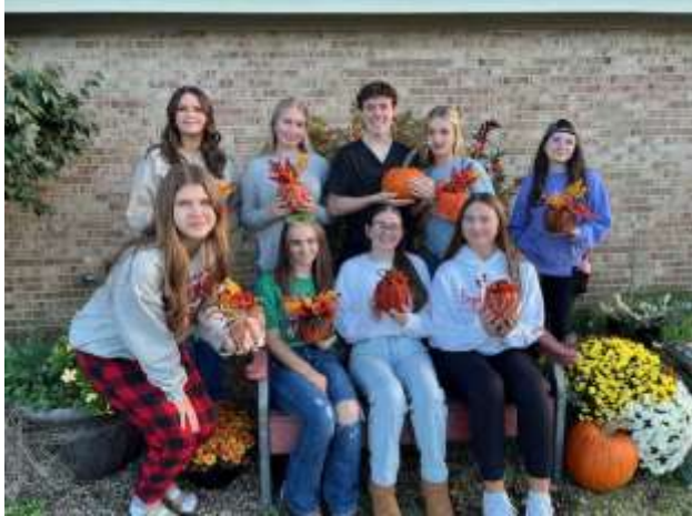
Members pledged their hands to larger service and have been working on various community service projects this year