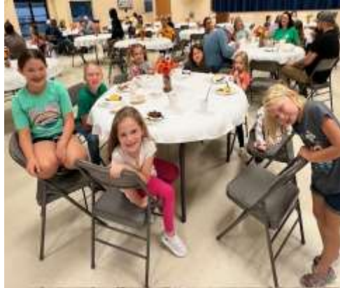
Cloverbuds enjoyed food and fellowship (and lots of cupcakes)