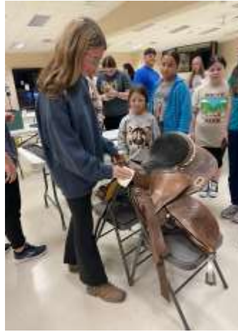
Horse Club members learn the proper techniques for caring for Tack

*Horse ownership is not required for participation in this club*