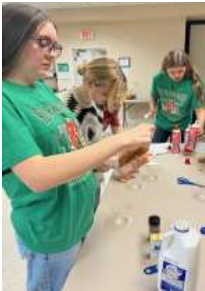
In November the Teen Council did a canned food drive for the 4-H Blessing Barn, a blanket drive for The Neighborhood, and learned how to make Pumpkin Pie in a Bag.