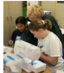
Homemaker Club Volunteers assist during sewing club lessons.