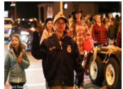
Boyd County 4-H Livestock Club "Country Christmas" float in the Ashland Christmas Parade