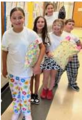
Pajama-clad students with their new pillows lined up for the Fashion Show.