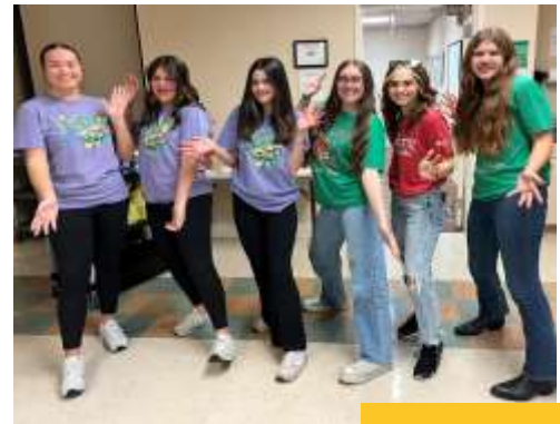
Members wore their favorite 4-H Camp T-shirts in honor of International Wear Your Summer Camp T-shirt Day #campshirtday