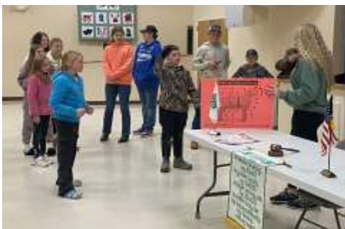
Livestock Club members learn about Sheep Anatomy